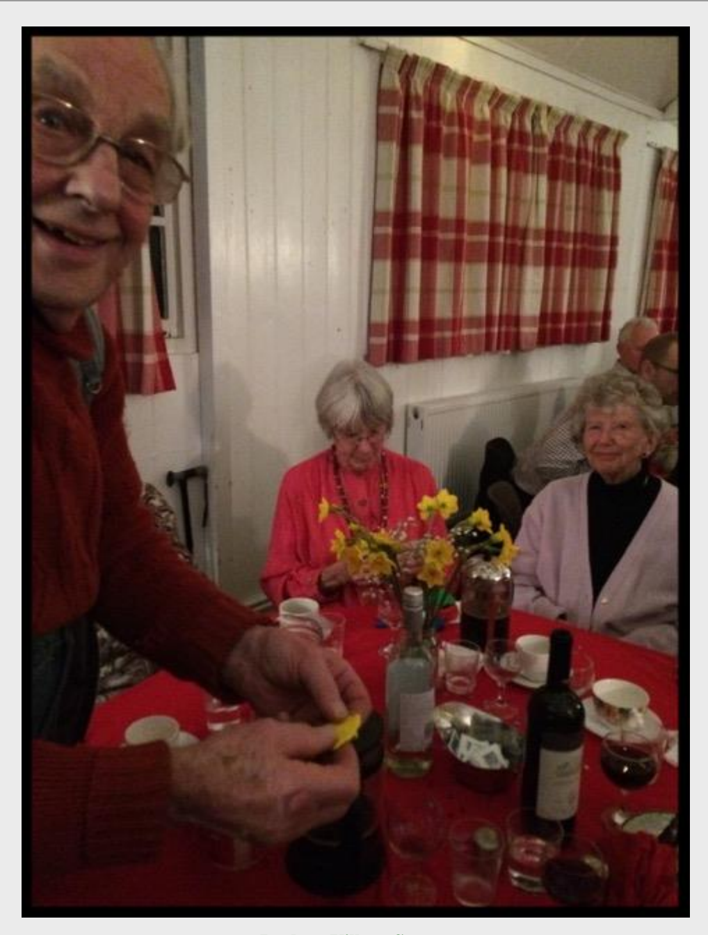
Jordans Village Supper Saturday 18th February 2017 in the Village Hall

The annual Jordans Village Supper, to commemorate the founding of the village on 15th February 1919, is held on the closest Saturday to the anniversary.