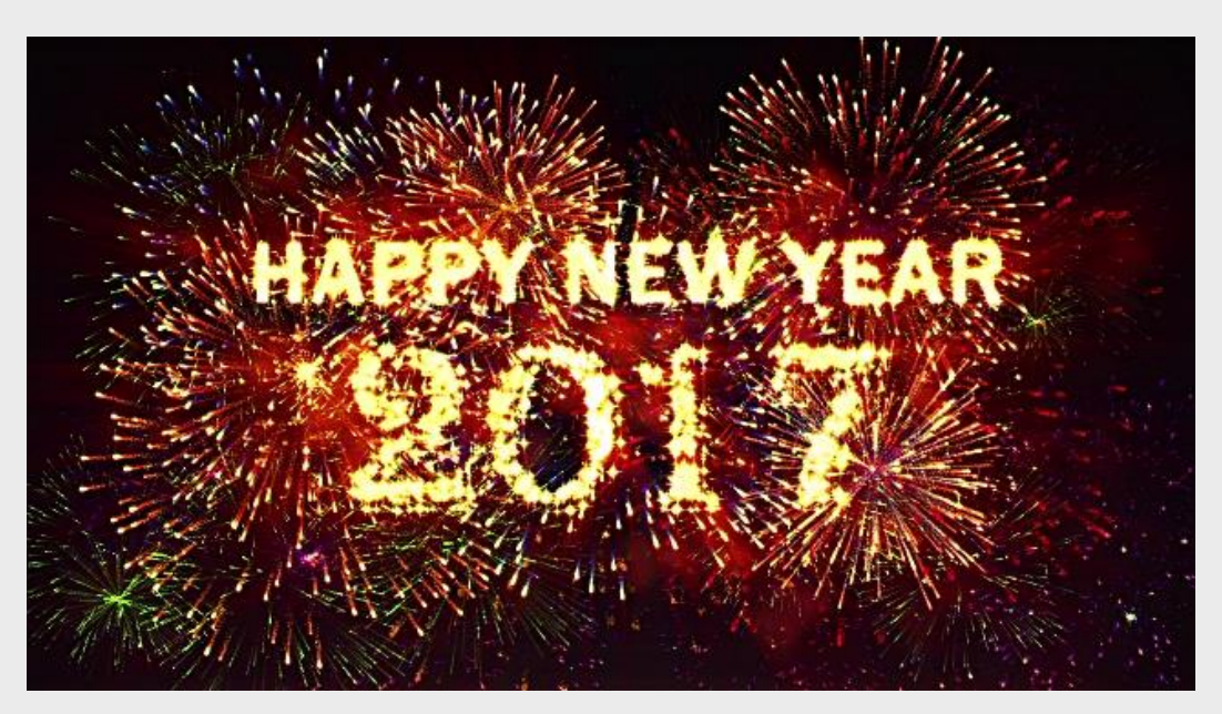
Welcome to 2017!

Welcome to the January edition of the Jordans Village Newsletter, and as we emerge from the fog that settled over the Chilterns during the Christmas and New Year break, we are already looking forward to many exciting events coming up in the next month or two.