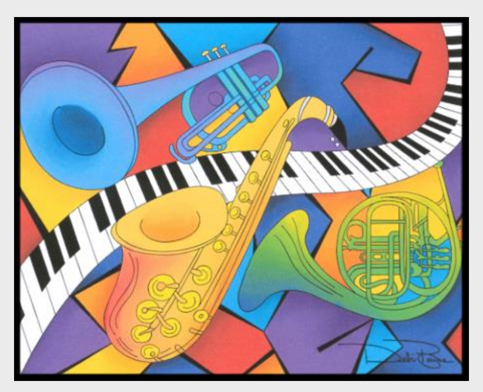
Jordans Village New Year Concert Saturday 28th January 2017 From 8 pm in the Village Hall

The next Jordans Village Concert will be on Saturday 28th January, when local musicians will get together to enjoy music making. We will perform a variety of pieces — on piano, violin, cello and flute. We will be delighted to welcome as many friends and neighbours as possible to share our music making.