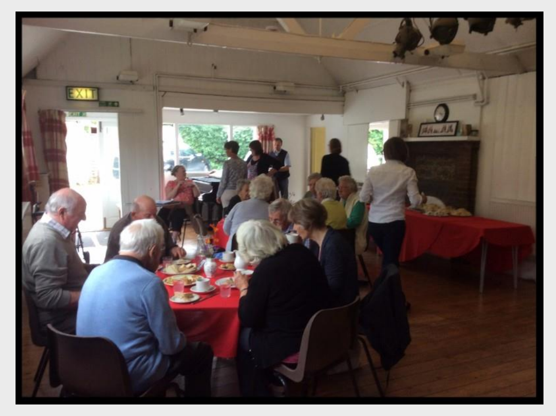
Lunch Club 2017

One of the great monthly traditions in the Village is Lunch Club, and the dates for 2017 have been announced.