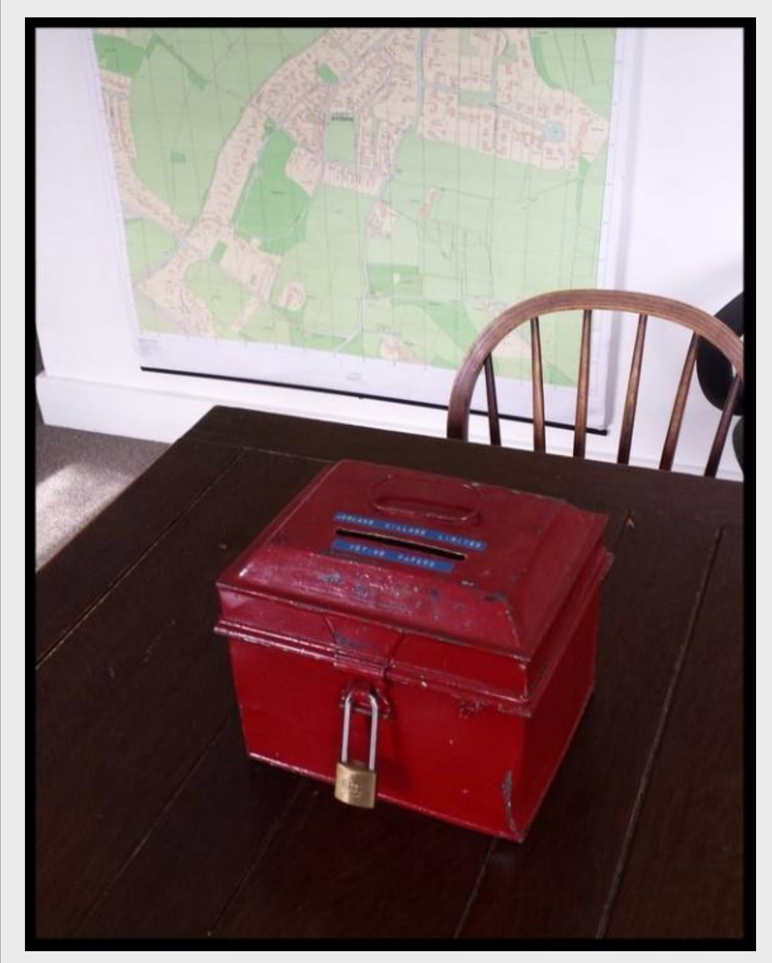
JVL Election 2018

JVL shareholders will this month be sending in their votes for two new Members of the Management Committee, ahead of JVL's 98th AGM on Wednesday 21st March 2018.